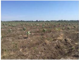
30 days Old