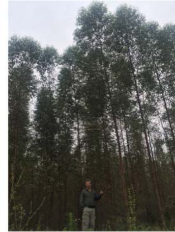
14 months Old