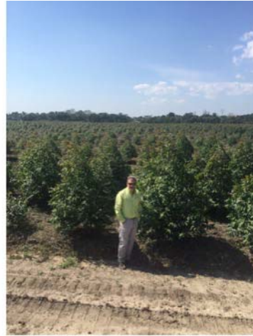
5 months Old