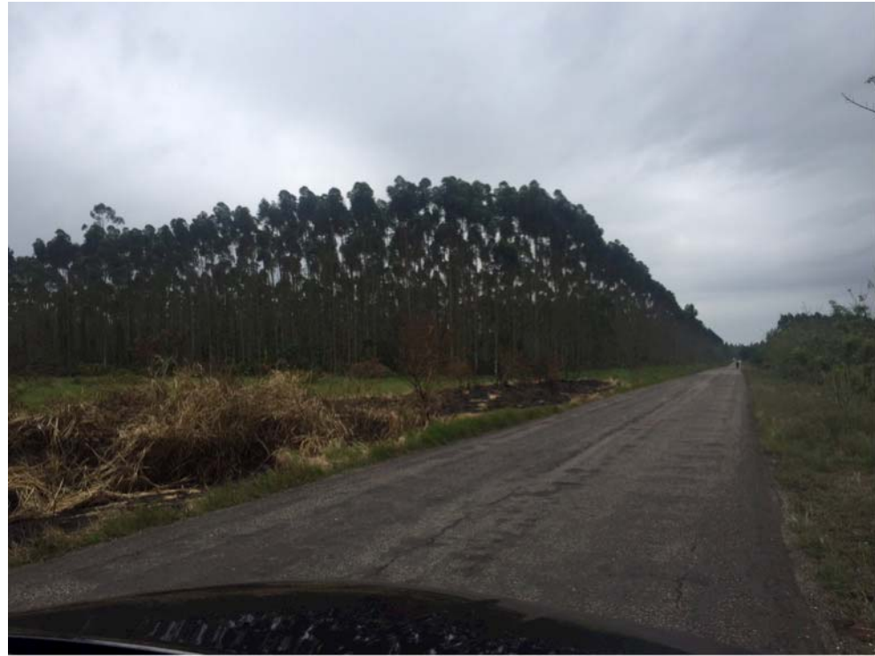
Seedling Plantation vs Clone Plantation. Both planted the same day